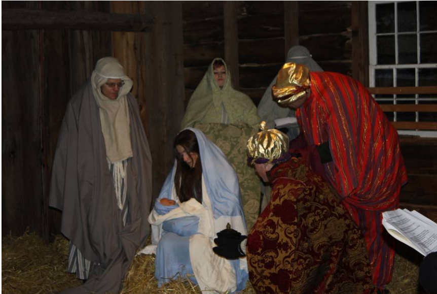
Last year's Living Nativity Scene at the Farmer's Museum Candlelight Evening

.Our Advent season derives its name from the Latin word, "coming towards." In the four weeks leading up to Christmas we prepare ourselves to celebrate the great feast of the Incarnation. We also recall another coming promised by God, the return of Christ in glory to judge the world and bring God's work to completion. Our wider society, like an impulsive child, urges us to keep Christmas ever earlier, but the Church insists that we must spend our time in the solemn disciplines of Advent—prayer, fasting, seeking forgiveness—before we undertake the proper joy and pageantry of the Christmas season.