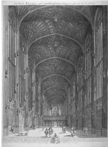
King's College Chapel